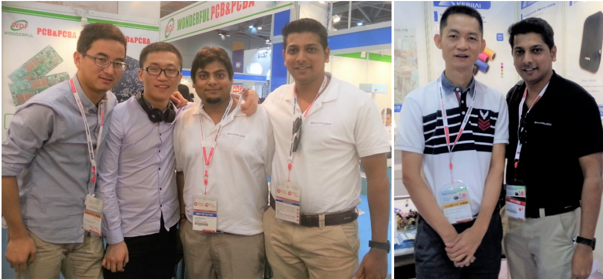
SmartKlock meets with component manufacturers in Hong Kong