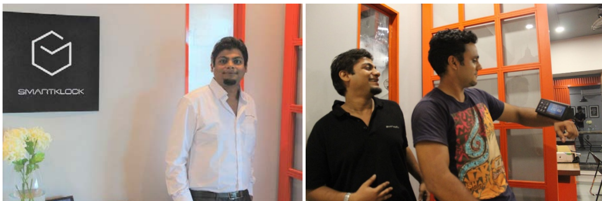
In the Boardroom

For SmartKlock, hardware is just one component of a broader strategy that involves sales of digital goods and may include digital advertising on certain clock channels. SmartKlock includes a device component (the SmartKlock One), an app/cloud component and an online channel store. This will allow us to scale where we sell digital goods and features for the clock (i.e. premium notification channels, themes, clock faces, alarm tones etc.) In fact, ultimately, I believe the sales of these digital goods and perhaps targeted digital advertising individual channels will far exceed the revenue from device sales alone. We are at the confluence of hardware and software, and that’s a very exciting space.