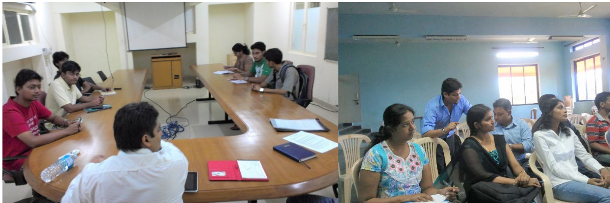
With SmartKlock interns (Left: BITs Pilani, Right: RIT College)

Apart from the core team listed above, SmartKlock has been supported by 29 interns from BITs Pilani and SRIEIT College in Goa. We also continue to be advised by a rotating cast of brilliant electronic engineers, hackers, process guru's and even logistics and crowdfunding experts.